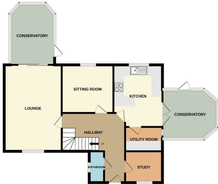
GROUND FLOOR 916 sq.ft. (85.1 sq.m.) approx.